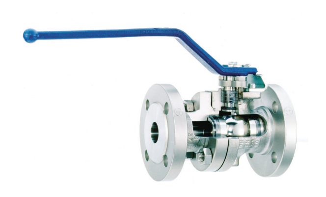
Figure 3. Krombach<sup>®</sup> metal seated ball valve.