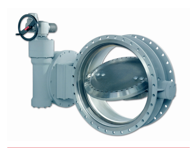
Figure 4. Krombach<sup>®</sup> triple offset butterfly valve.

the disc reacts immediately to limit backflow and slamming. This design can minimise the damaging effects of water hammer, eliminate chatter, protect rotating equipment, reduce pressure loss in piping systems and provide a quick dynamic response for immediate shutoff. The typical line size for this valve will be 30 - 48 in. but can go larger to 72 in.