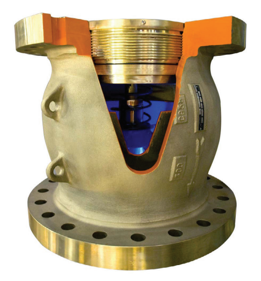
Figure 2. Highly engineered Noz-Chek<sup>®</sup> valve.