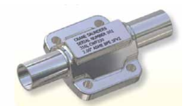
Please visit our Web-Based Drawing Library at: www.saundersdrawings.com for current database of drawings in PDF, 2D DWG, and 3D STP formats.

Saunders® Life Science Diaphragms meet all requirements of ASME BPE part SG (Seals). This includes General Provisions, SG-3.1, and conformance per SG-3.4.