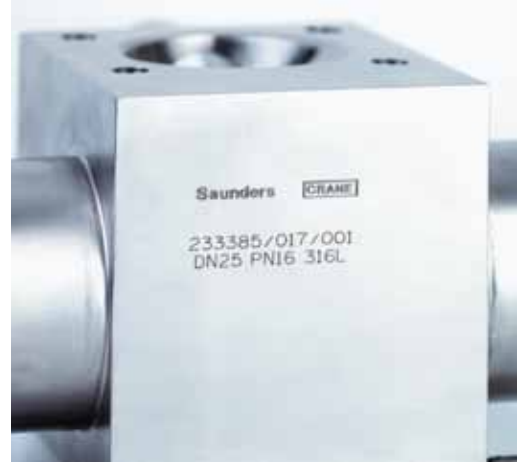
Machined from block bodies are marked in suitable location on block.

Saunders® full portfolio of drawing data can be accessed at www.saundersdrawings.com in both 2D and 3D file format.