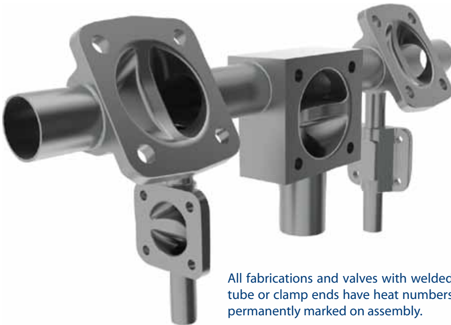
All fabrications and valves with welded tube or clamp ends have heat numbers permanently marked on assembly.