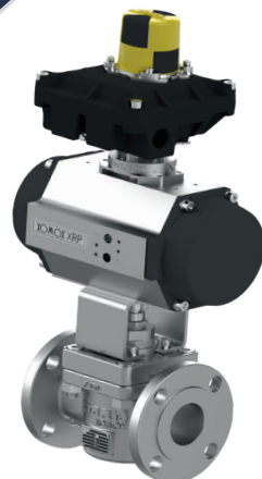
*Sleeved Plug Valves