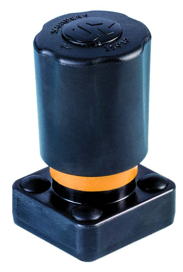
Optional stainless steel base available upon request.