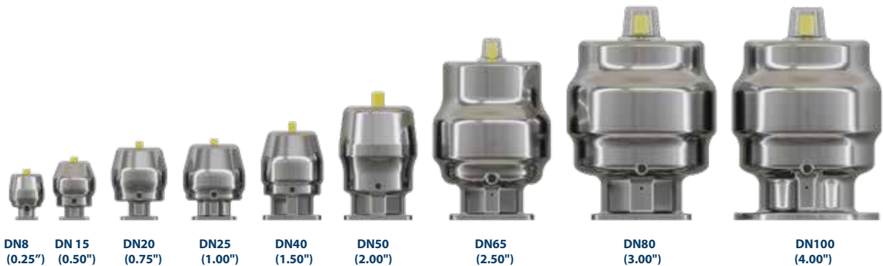
DN8 (0.25") DN15 (0.50") DN20 (0.75") DN25 (1.00") DN40 (1.50") DN50 (2.00") DN65 (2.50") DN80 (3.00") DN100 (4.00")

The S360 Lite range provides standard closure for normally closed applications in a very compact, lightweight package and is ideal for most applications. The S360 Lite fits into tight piping arrays – and its compact size can even help reduce block valve design and is available through sizes DN8 – DN100 (0.25" – 4.00").