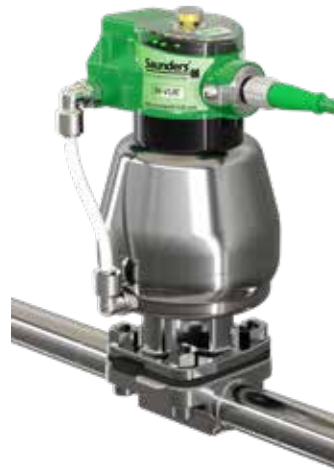
Direct Mount M-VUE

*Available with Limit Open Stop on request