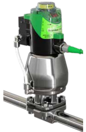
Direct Mount I-VUE

Visit www.saundersS360.com for additional information on other Saunders ® products, including technical datasheets, drawing library, and product selection tools.