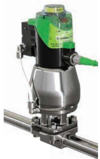
Direct Mount I-VUE

Visit www.saundersS360.com for additional information on other Saunders ® products, including technical datasheets, drawing library, and product selection tools.