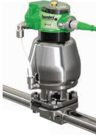
Direct Mount M-VUE

*Available with Limit Open Stop on request