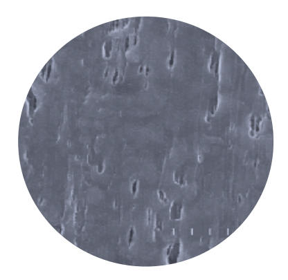
Paste Extruded - PTFE liner