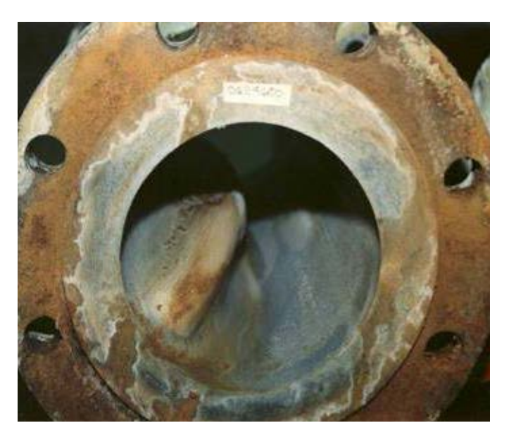
Single Lobe Liner Collapse