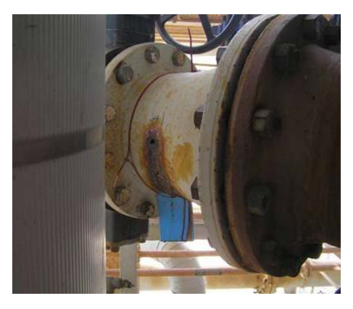
Appearance of a Leak

All plastic will permeate; this is a natural phenomenon and does not detrimentally affect the performance of the PTFE liner. The result, however, can affect the system performance and life cycle costs. These pictures depict some of the issues caused by permeation.